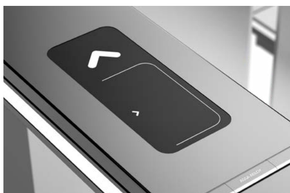
Card reader cover (option)